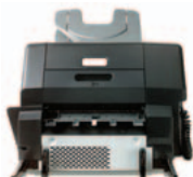
(Q5692A) 4 700-sheet 3-bin mailbox – assign to individuals or device functions