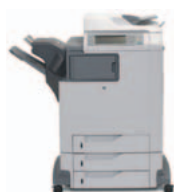
HP Color LaserJet 4730xs mfp