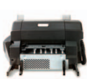
(Q5691A) 3 Stapler/stacker – staple up to 30 pages; stack up to 500 sheets