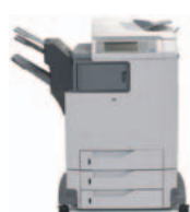
HP Color LaserJet 4730xm mfp

The HP Color LaserJet 4730mfp is perfect for mid-volume workgroups (from 6 – 15 users) in enterprise environments and workgroups (from 3 – 10 users) in small and medium businesses with IT management, that print A4 documents in mono and colour and need the benefits of multiple functionality to enhance their productivity.